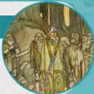
Marble Arch Caves

legend says that Finn MacCool made Lough Neagh as well as the Giant's Causeway