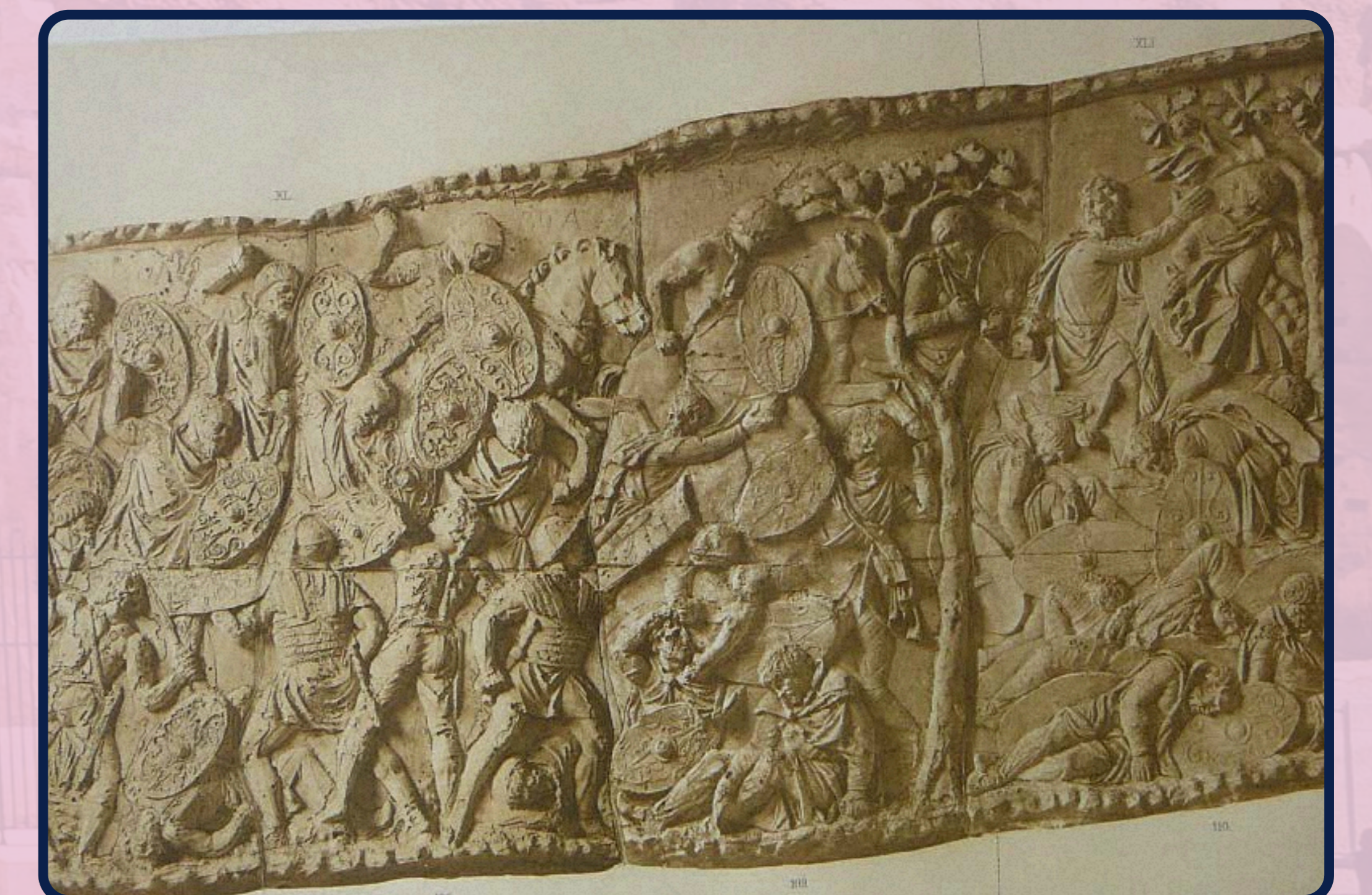
Relief from Trajan's Column (113 CE) showing the Roman army