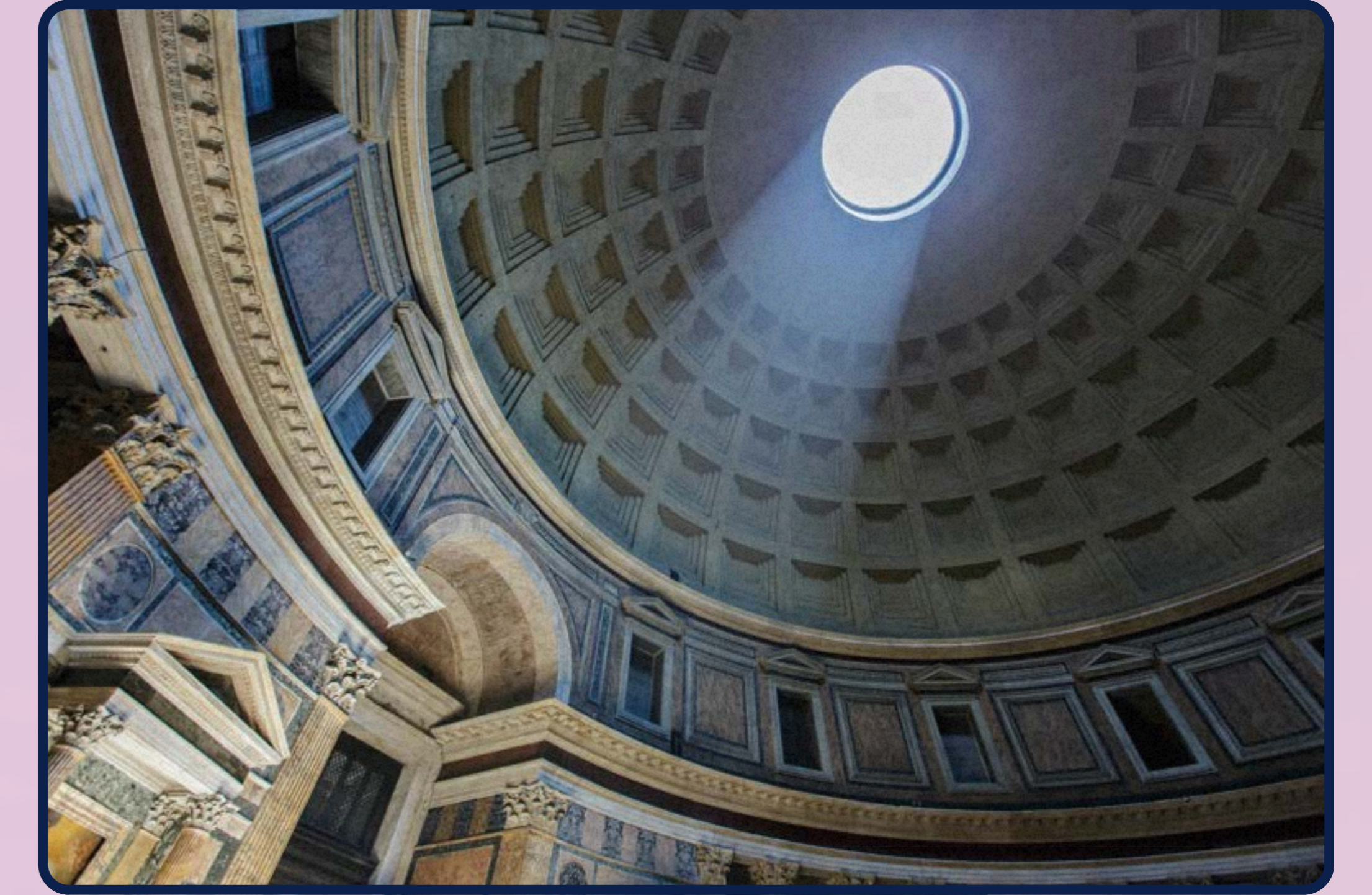
The Pantheon (126 CE)

A band of paintings or sculptures in relief