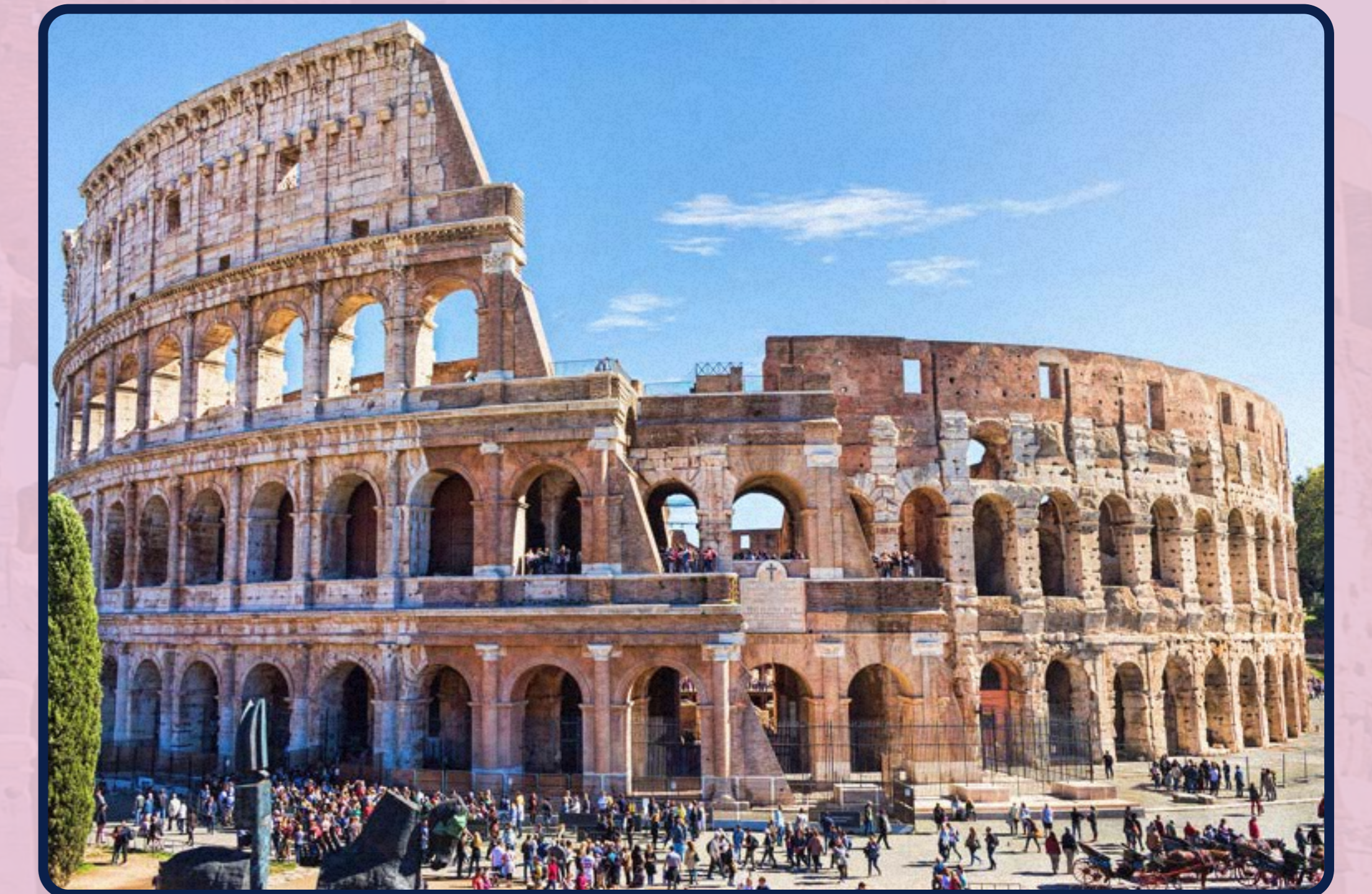
The Colosseum (80 CE)