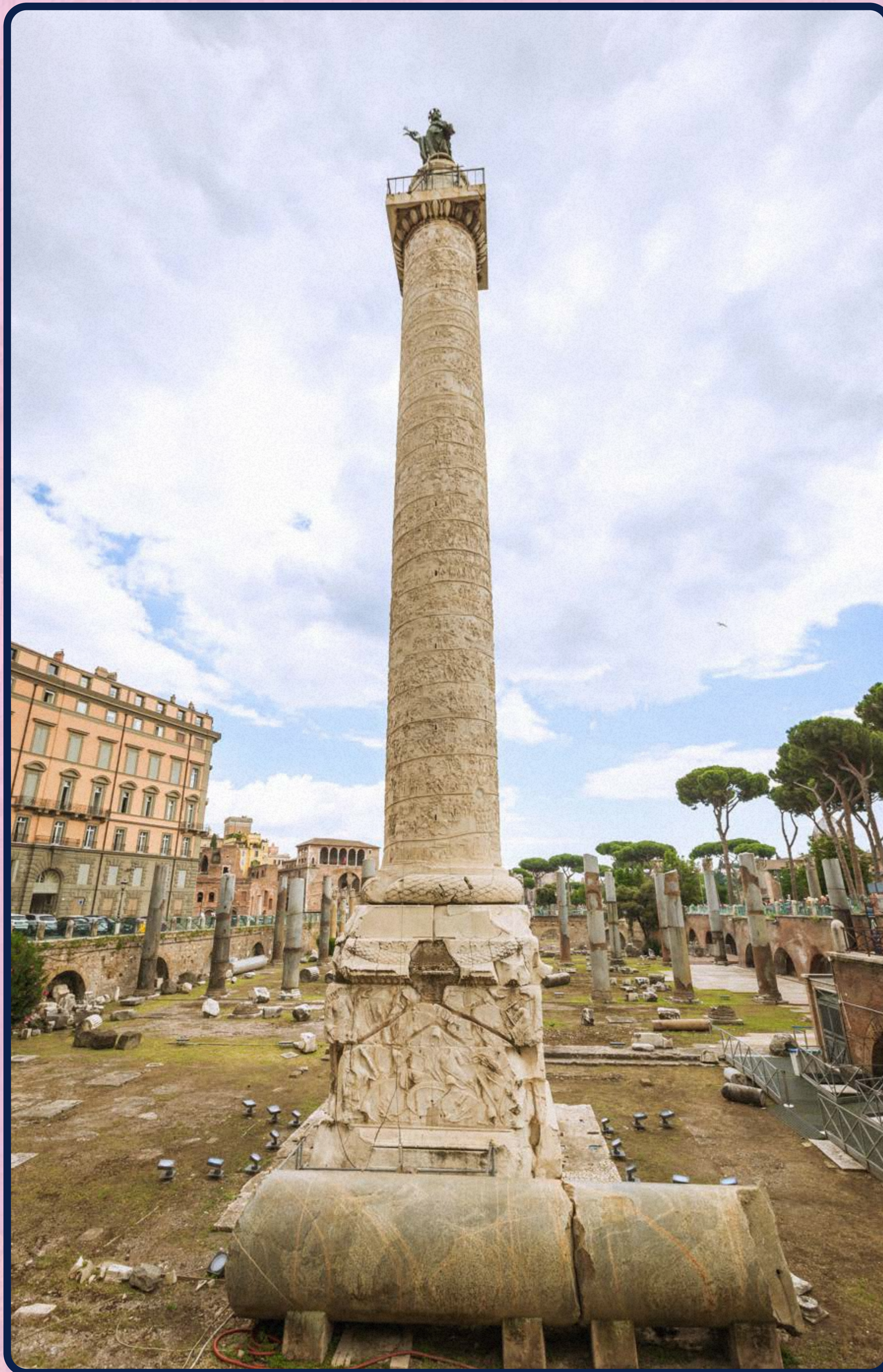
Trajan's Column (113 CE)