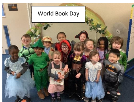
World Book Day