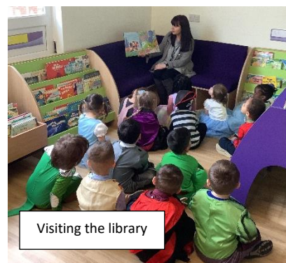
Visiting the library