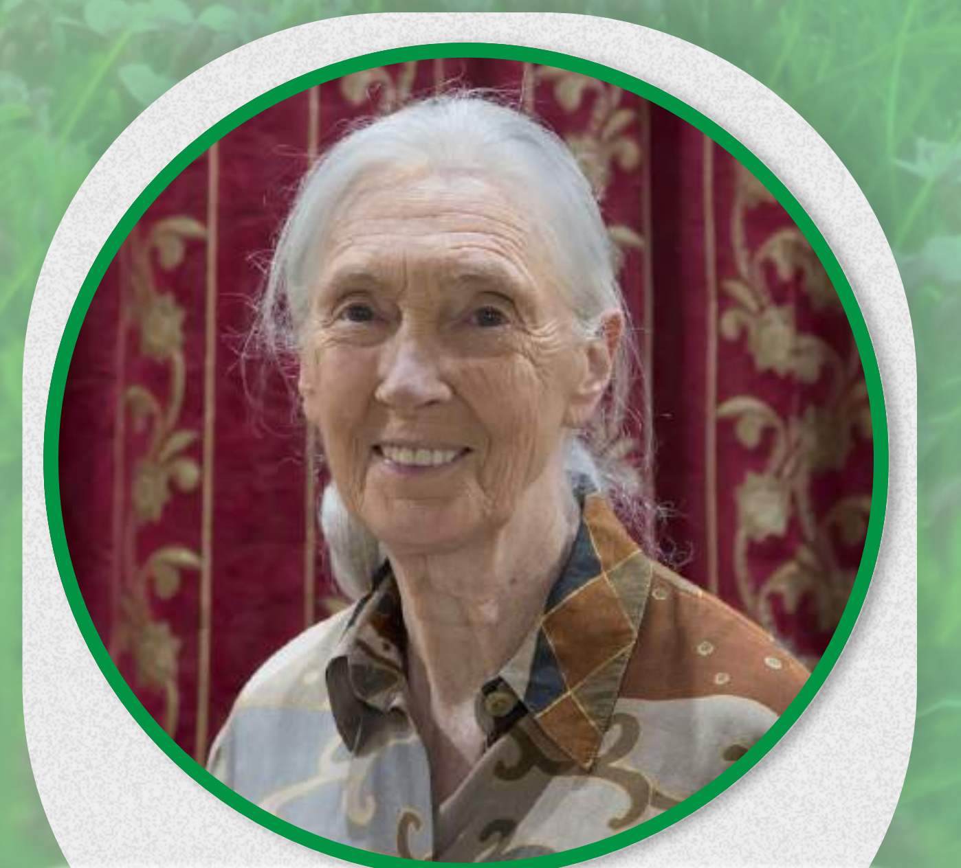
Dame Jane Goodall

a primatologist and world expert on chimpanzees