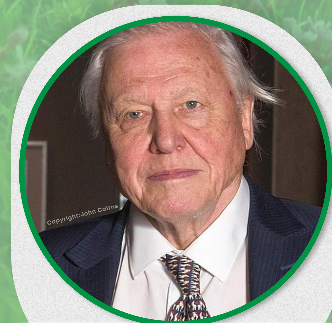
Sir David Attenborough