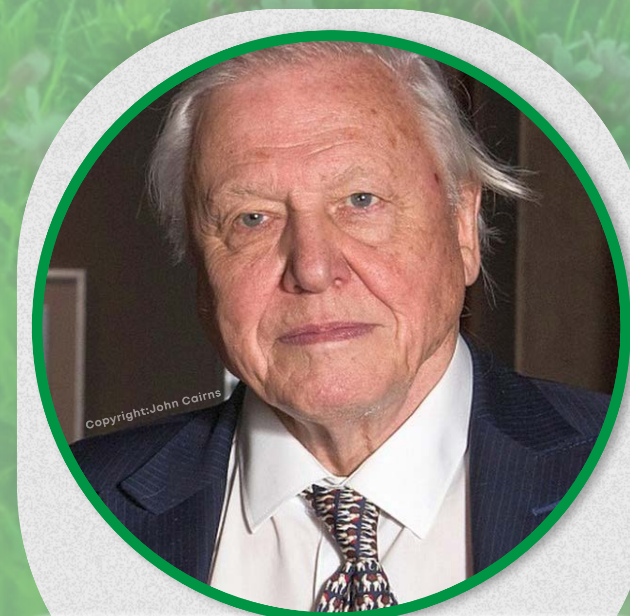
Sir David Attenborough