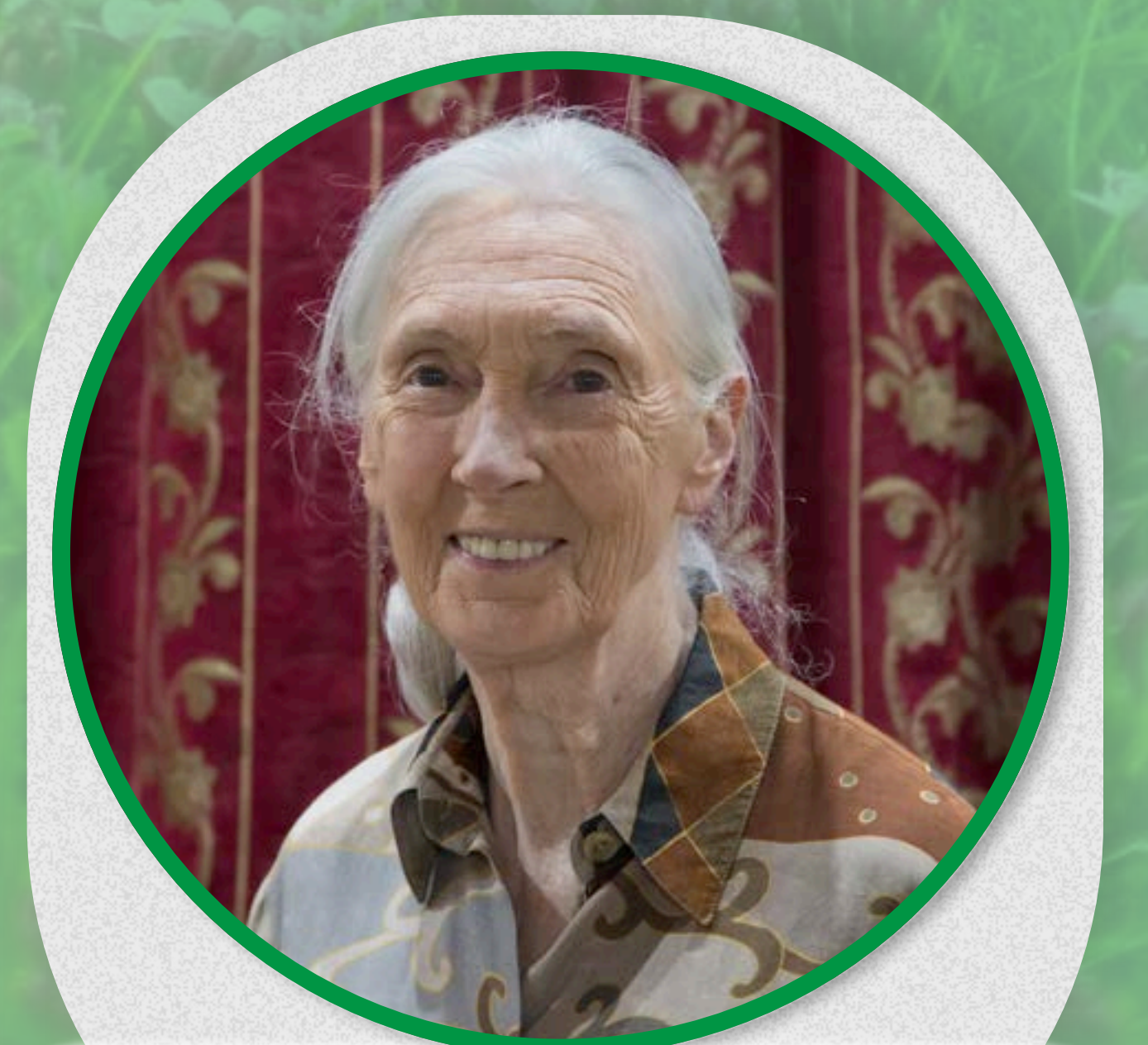
Dame Jane Goodall

is a primatologist and world expert on Chimpanzees