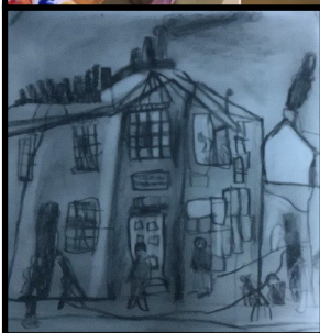
A beautiful drawing by Eloise in Year 3.