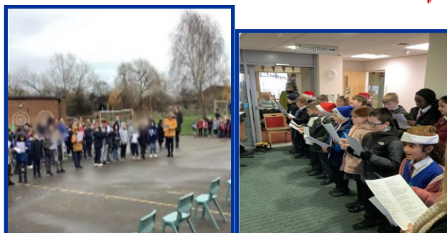
Year 5 delivered a beautiful performance to the residents of Trinity House and KS2 children spread joy and the Christmas spirit by carol singing for our families.