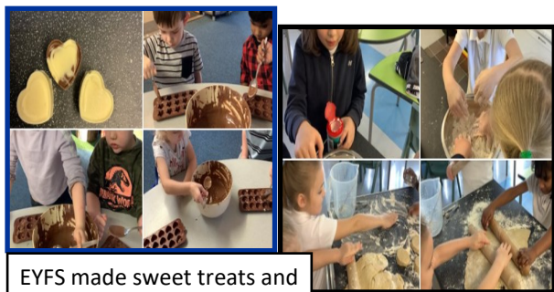
EYFS made sweet treats and Year 2 children baked scones to give to their loved ones.

We have been spreading the love this week at St John's for Loving Week. Children have been carrying out acts of kindness for their friends, family and the St John's community.