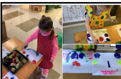
Early Years children used fruit stamps to create portraits inspired by Giuseppe Arcimboldo

Children have also been getting creative this week as we celebrated Art Day on Thursday. The children absolutely loved the opportunity to show off their creative flair, producing some truly amazing works of art!