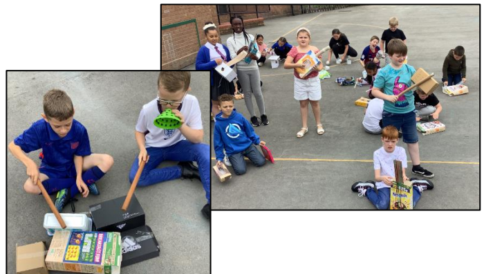
Year 4 practising a class performance of Mamma Mia from Charanga

Y4 have designed and made their own musical instruments as part of Science work about sound production.