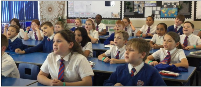
Year 2 performing "I Wanna Play in a Band," from Charanga

Award-winning music education technology, digital music programmes, partnerships and quality-assured training for teachers.