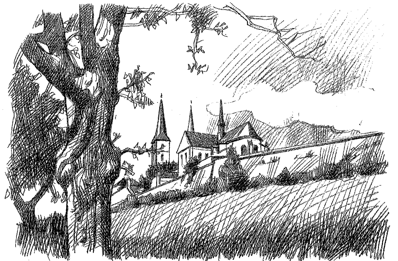
Stage 4 More detailed tones added with crosshatching.