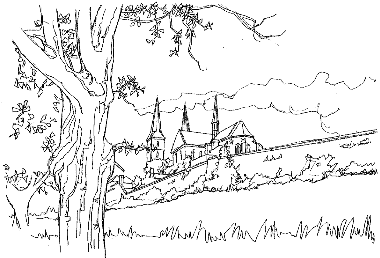
Stage 2 Individual elements of the scene outlined.