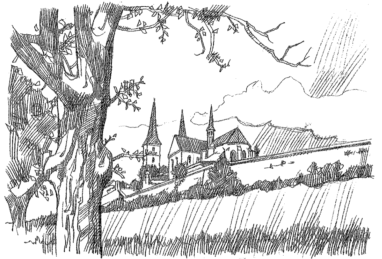
Stage 3 The most important tones outlined.